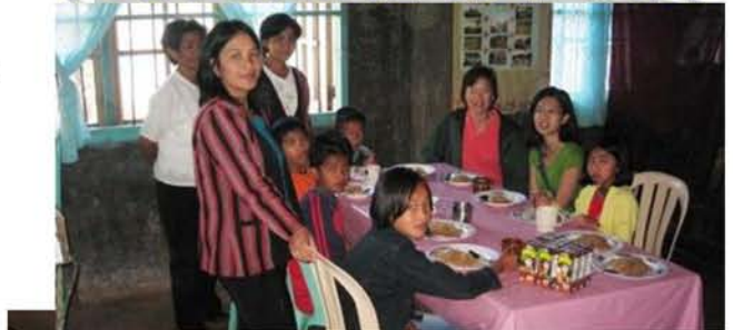
Moon Tee donated some cartons of UHT milk for the student nourishment program at a local elementary school nearby APTS.