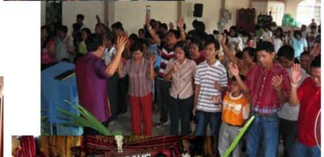
Altar Ministry at a local church worship service.