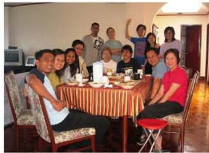
APTS small group fellowship at our new apartment

We have moved to a faculty apartment after being housed in a student apartment for two years. The rental will be much higher and will impact our budget significantly. However, the rental we pay will go to APTS because that is one of the ways the seminary finances itself. The apartment has been a blessing for a few short term missions teams that have come our way because we now have a couple of extra rooms to house them. Let us know if you have plans to send short term teams. There may be room for you at our apartment. We would like you to come by and fellowship with us.